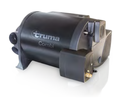
Truma RV Heater