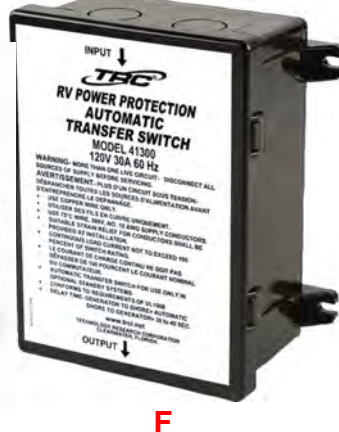
TRC model 41300