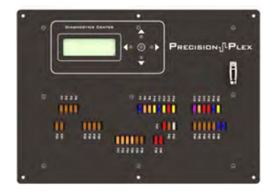
Precision Circuits Inc. 12 Volt DC Fuse panel Diagnostic Center