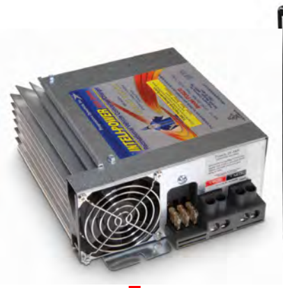
Progressive Dynamics Series 9200